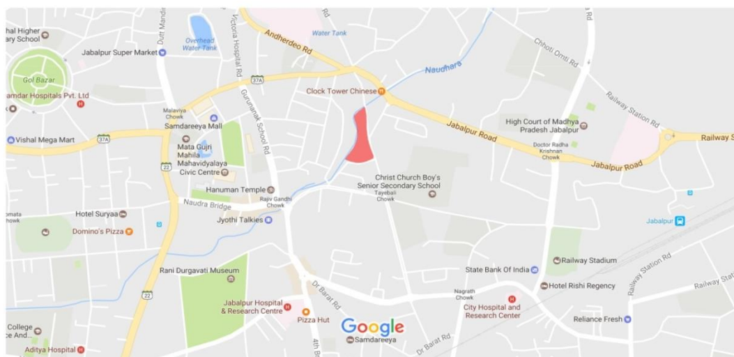
200 m